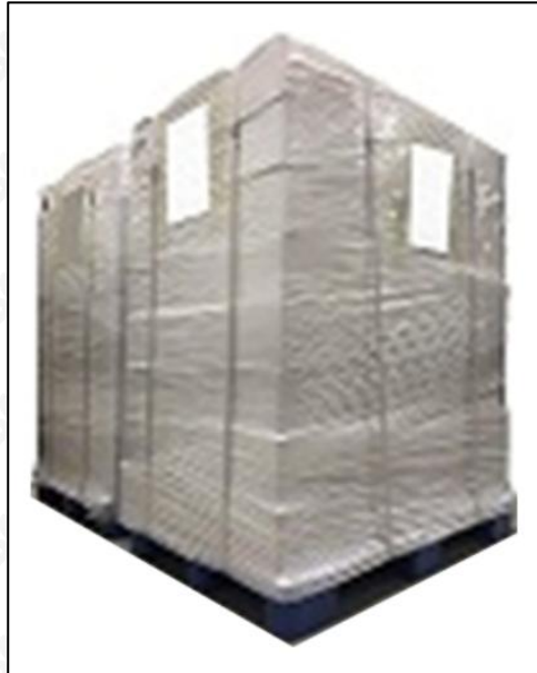
Pic No. 3

International express packaging: Wrapped with yellow tape after wrapping black protective film