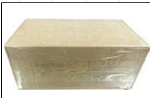
Pic No. 1

Domestic express packaging: Wrapped by Transparent tape